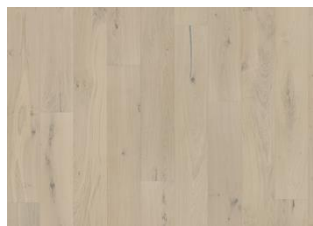
Loft White Plank