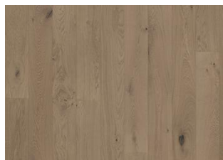
Frozen Hazelnut Plank