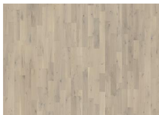
Loft White Strip