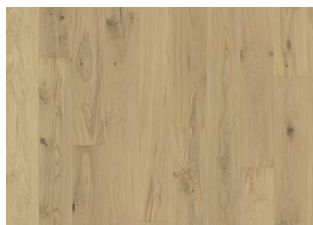
Urban Brown Plank